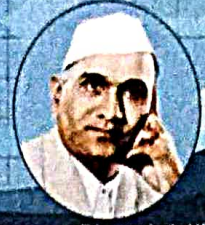
Karmaveer Bhausaheb Hiray